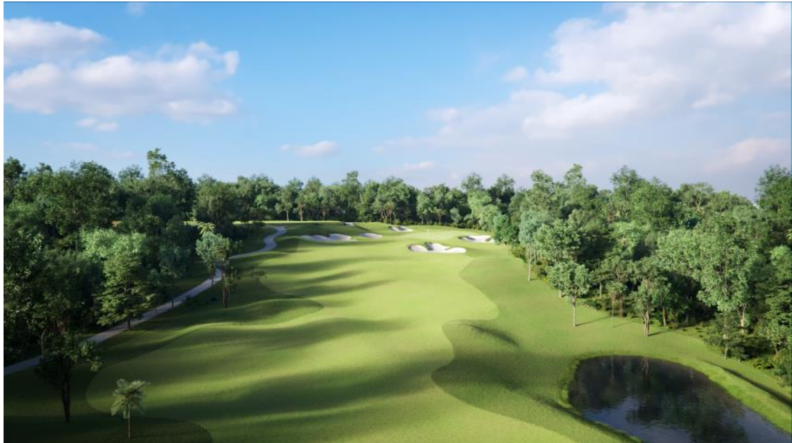
(Hole #21, Image 1: With a slight left to right bend the uphill hole has bunkers to the left with a water catchment pond.)