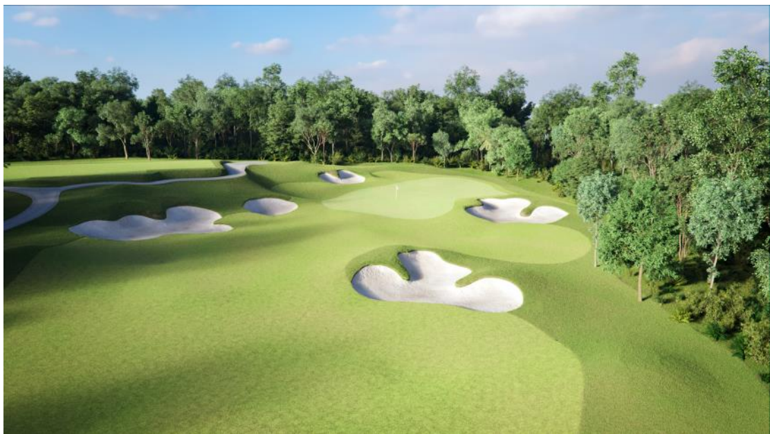
(Hole #21, Image 2: Players would have to navigate well positioned bunkers during approach shots into onto the green.)