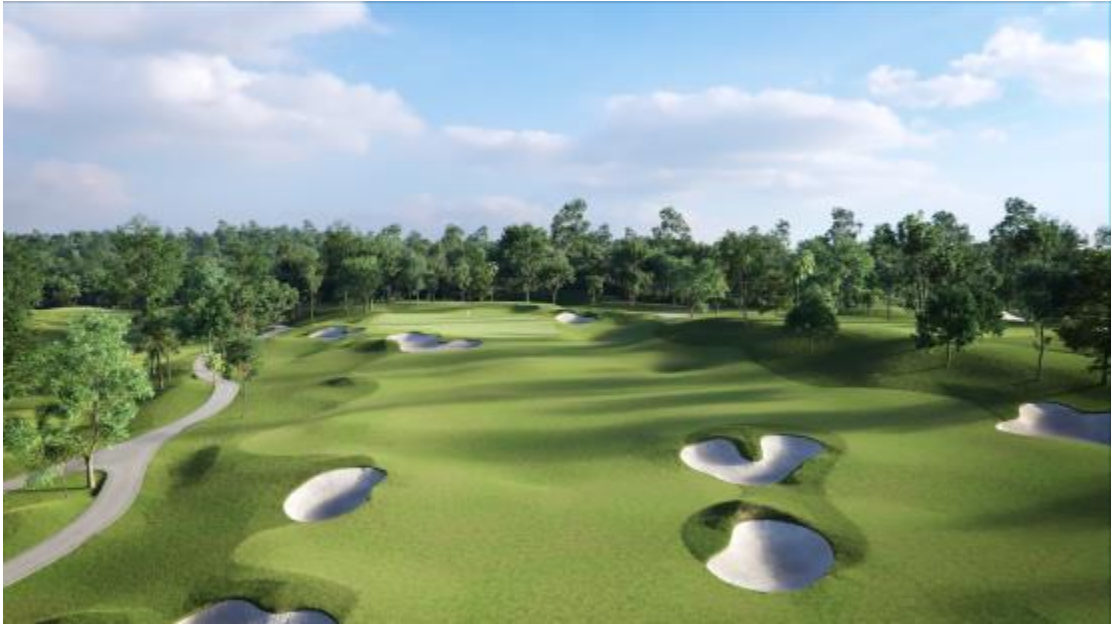
(Hole 6, Image 1: A well-designed Par 4 features a creek splitting the fairway and a dog leg left.)