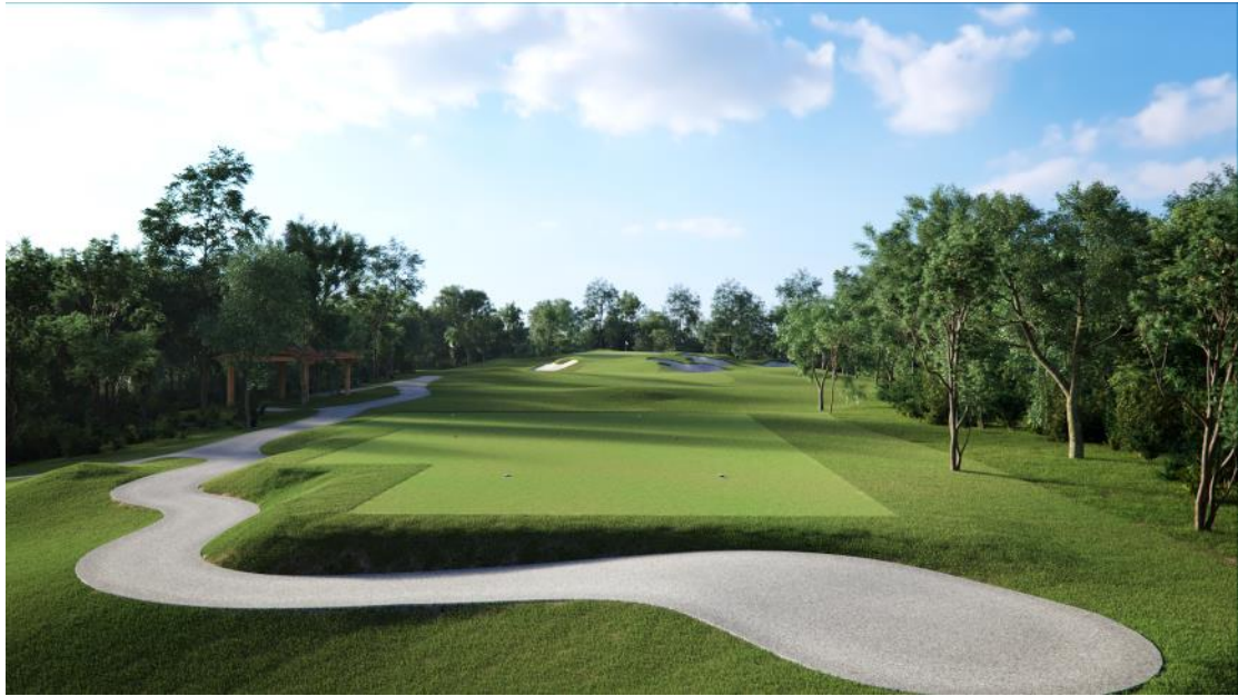
(Hole #22, Image 1: A short downhill Par 3.)