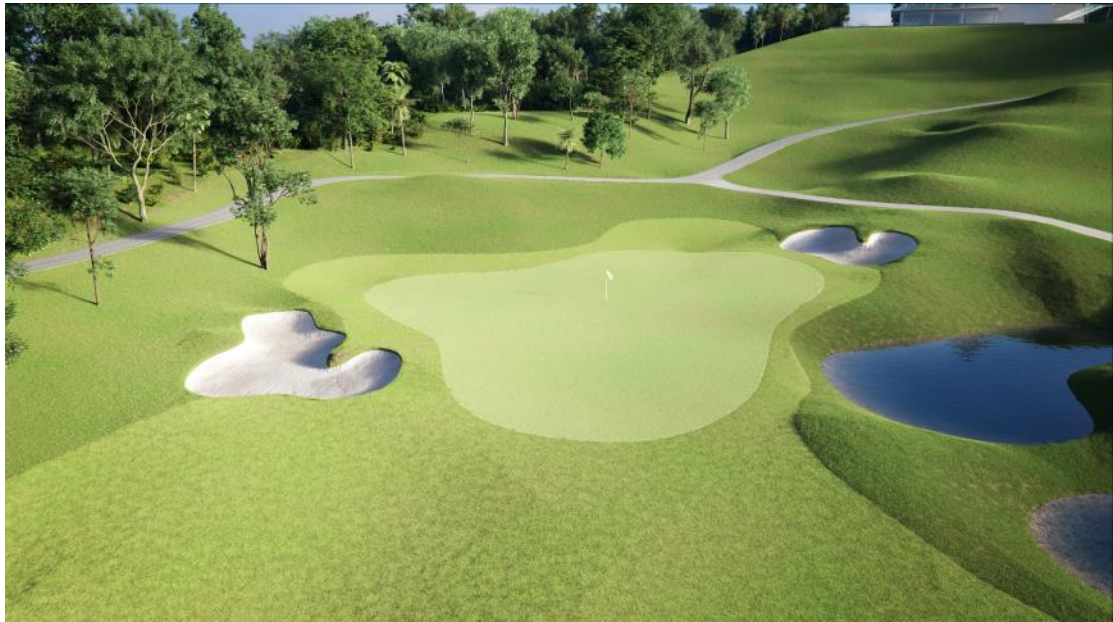
(Hole #9, Image 2: The green is protected by a water catchment pond on the right of the green and a bunker before the green on the left.)