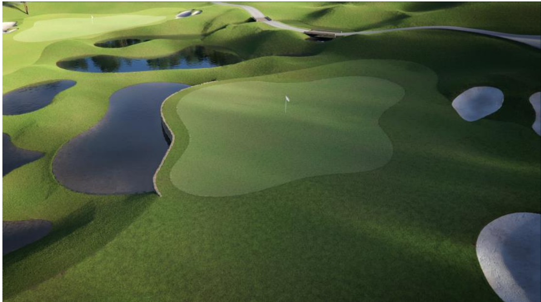
(Hole #18, Image 2: The slightly elevated green is protected with water on the left and bunkers on the right.)