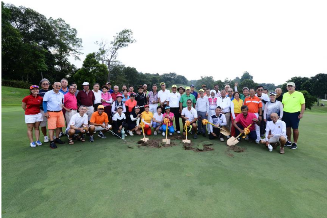
The SICC New Course Groundbreaking Ceremony on Sunday, 24 February 2019.