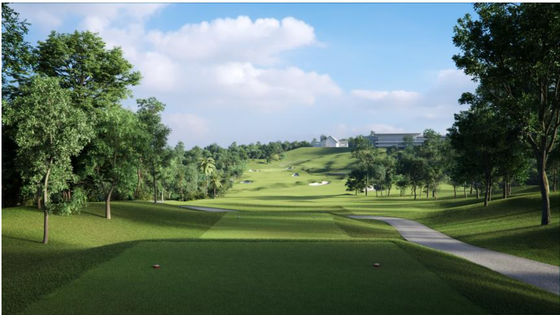
(Hole 6, Image 2: A straight Par 4 that requires an accurate tee shot into the landing zone split by a creek crossing the fairway.)