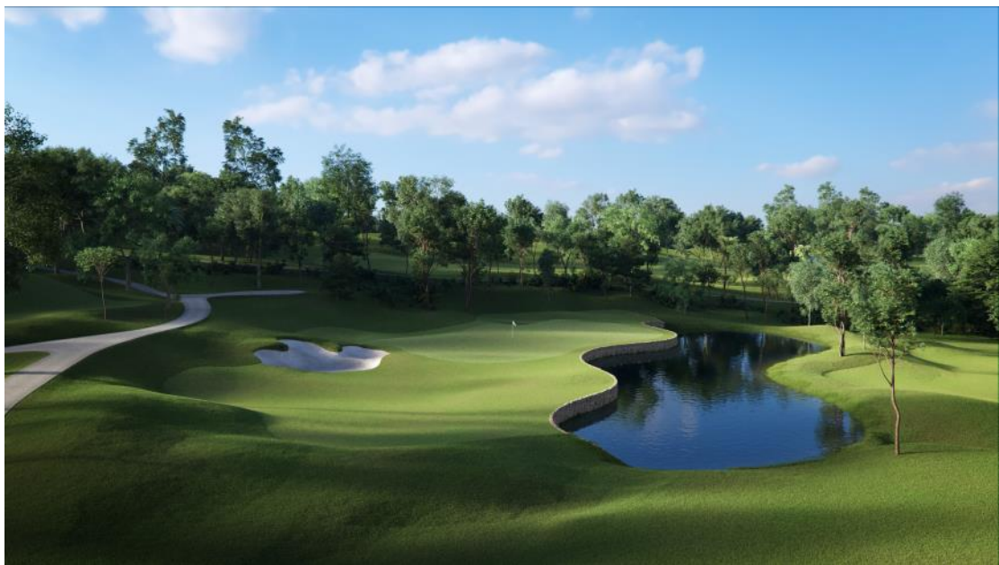
(Hole #13, Image 2: A single catch bunker protects the left side of the green.)