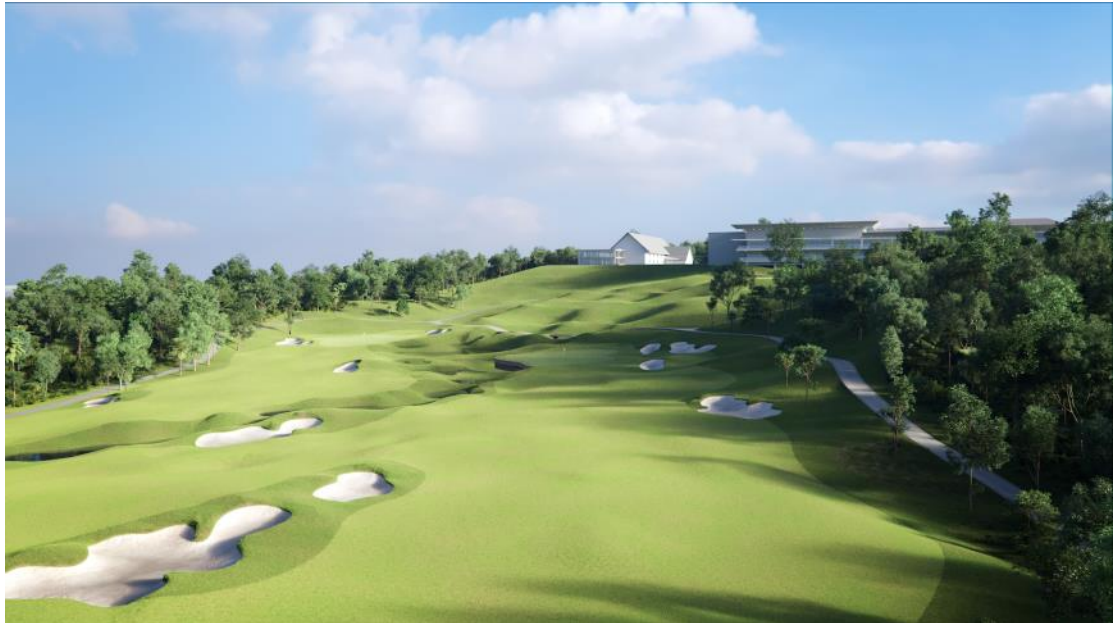
(Hole #18, Image 1: Longer hitters can take on the dogleg which will be an advantage.)