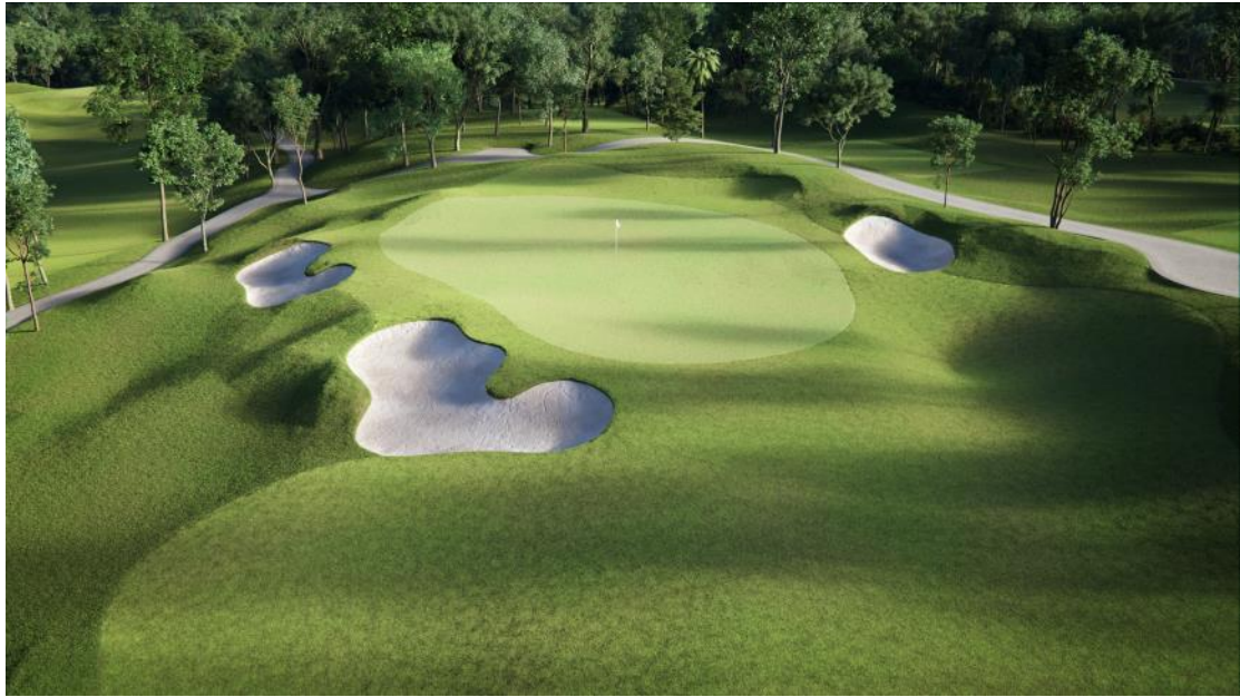
(Hole #9, Image 1: Approach onto the green is well protected by bunkers.)