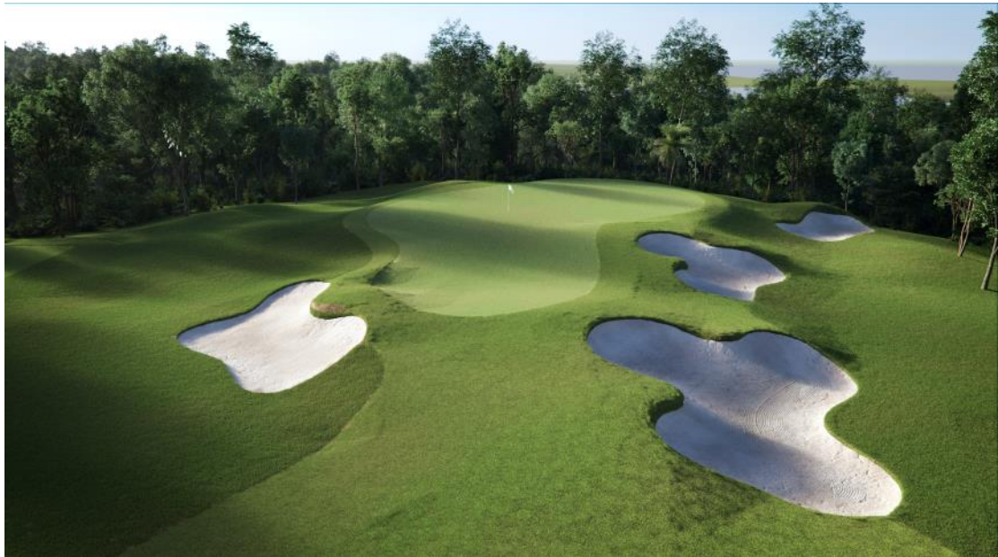
(Hole #22, Image 2: The green is protected by bunkers on both sides and run off at the back of the green.)