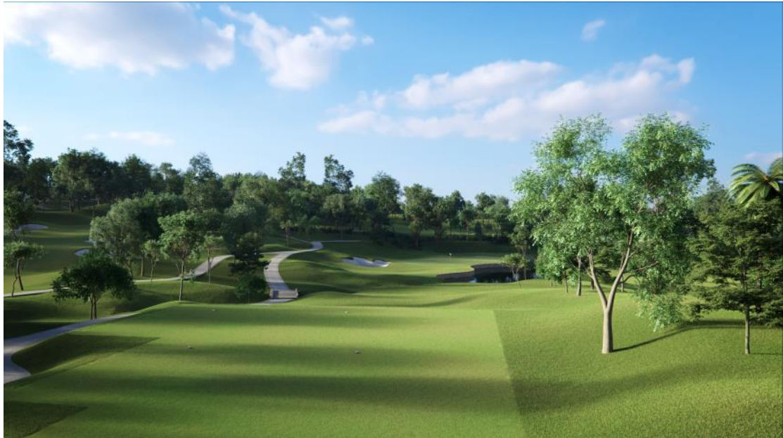
(Hole #13, Image 1: With water all along the right side of the approach and green, this Par 3 hole demands an accurate tee shot.)